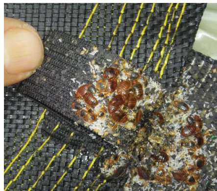
Figure 1 The source was identified as a bedroom with an infestation level of 4 on a 5-point scale.

The property was a single-family home with 3 bedrooms, occupied by a family of 4. The source of the infestation was identified as the son's room, which was rated at 4/5 in a 5-point infestation scale. The room contained a full-sized bed with high levels of staining on the mattress and bed frame. The other two bedrooms had lower levels of infestation (2/5) and a similar minor infestation in the living room. The clutter rating throughout the house was ~ 2/5.