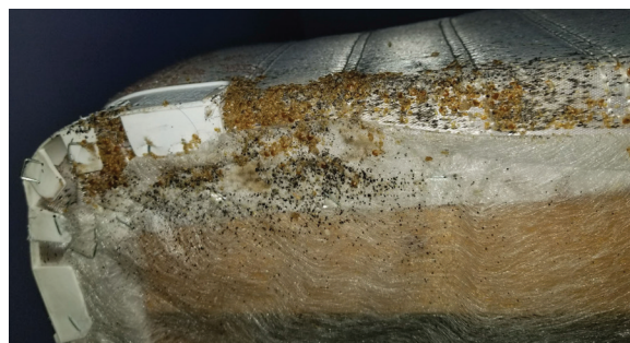
Figure 1 Signs of the infestation.

Due to the concern of both displaced and embedded bugs as a result of the 3 factors (DIY treatment, no host, and the excessive preparation), SenSci traps were placed in the bedroom (4) and living room (6) to draw bed bugs back in. The apartment remained vacant for another week because the tenant was so traumatized by the bed bug infestation.