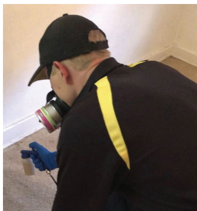
Figure 2 Applying the 2-inch Aprehend barrier above the baseboard.

The tenant reported that she saw some live bed bugs about 2 days after this follow up service. Witt Pest management continued to check in with the tenant, and SenSci traps were left in place to monitor for continuing bed bug activity. The tenant had no further reports and Witt had no further detections thereafter and was able to declare the apartment bed-bug free well within 30 days from the initial treatment.