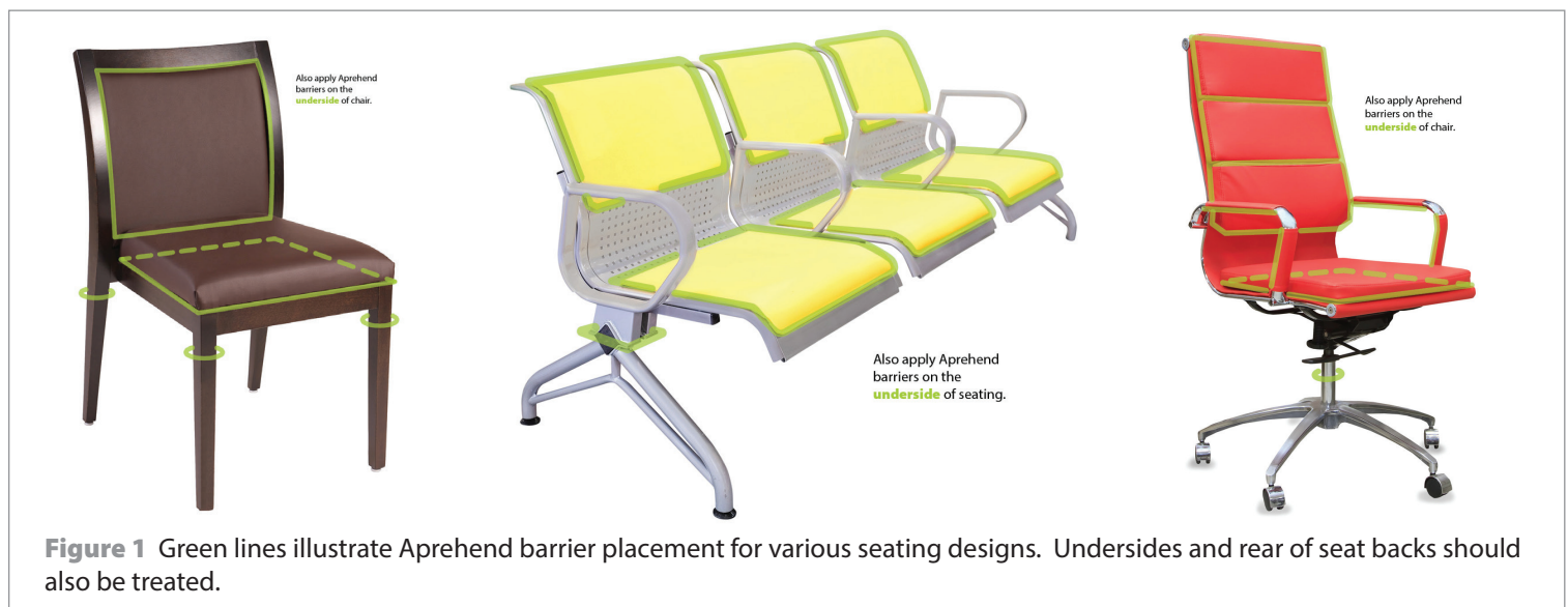
Figure 1 Green lines illustrate Aprehend barrier placement for various seating designs. Undersides and rear of seat backs should also be treated.

Aprehend should be applied as 2” barriers around the bottom perimeter of the seat of each chair and around each chair leg. Depending on chair design, apply Aprehend to upholstery crevices wherever bed bugs might choose to harbor if introduced. Apply barriers similarly to the rear side of the chair back and any potential harborage sites in the upholstery (Figure 1).