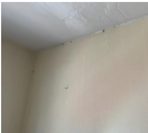
Figure 3 Bed bugs were present on the walls and ceilings in the unit upstairs.

The two apartments upstairs were vacant but also received a perimeter treatment of Aprehend on the baseboards, ceiling, windows, door frames, and closets. As with all bed bug products, Aprehend works best in an occupied apartment where human activity lures the bed bugs out of their harborages in search of a blood meal. Since Robinhood visits this property each week for general pest services, Clint treats the vacant apartments through an agreement with the property manager. (NOTE: for details on vacant apartment treatment, see the Aprehend Case Study – Eradication of bed bugs in a vacant apartment). The vacant units used ~2-3 oz. of Aprehend for treatment.