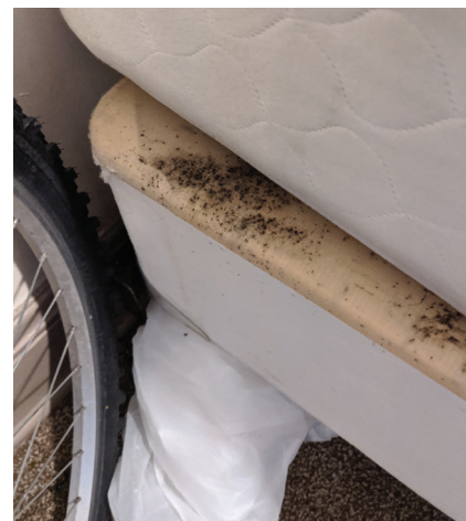
Figure 2 The unit was only mildly cluttered, not a hoarding situation.