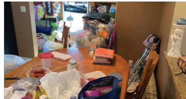
Figure 2 No prep was done by the tenant prior to treatment. Charles gained perimeter access by moving items to the bed.