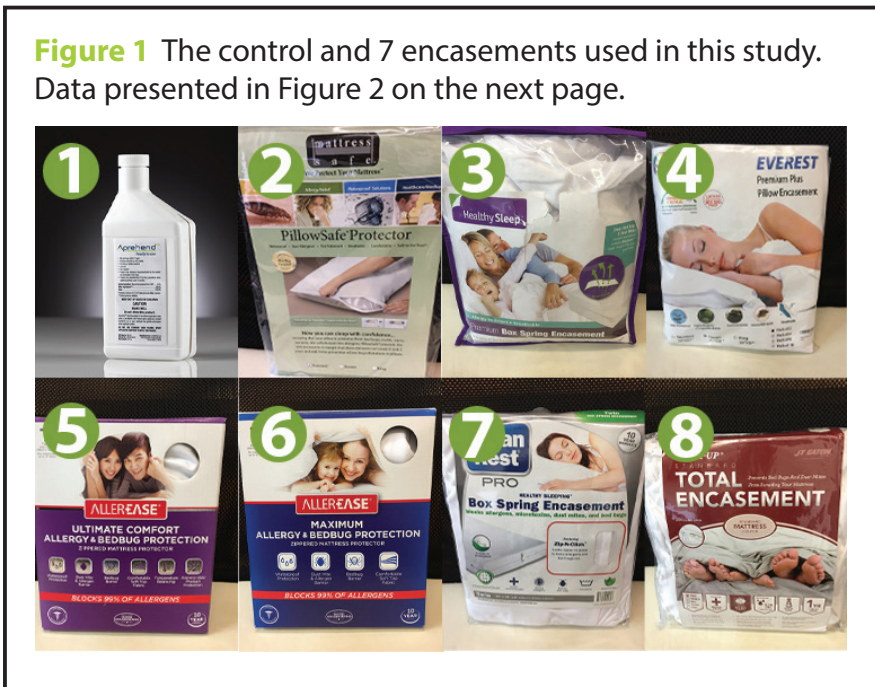
Figure 1 The control and 7 encasements used in this study. Data presented in Figure 2 on the next page.

This study was conducted to ensure that the fabrics and anti-feeding coating commonly used for encasements was not toxic to the spores in Aprehend. We applied spray barriers to seven brands of encasements commonly used by PMPs and the general public to evaluate the effect of the encasement material on the viability of the Aprehend spray barriers over time. We took samples of the sprayed encasements and performed germination counts on the spores 1 week, 5 weeks and 12 weeks after the spray application. Aprehend has a residual efficacy of up to 3 months, so we wanted to ensure that none of the products tested resulted in a reduction in this long-term residual.